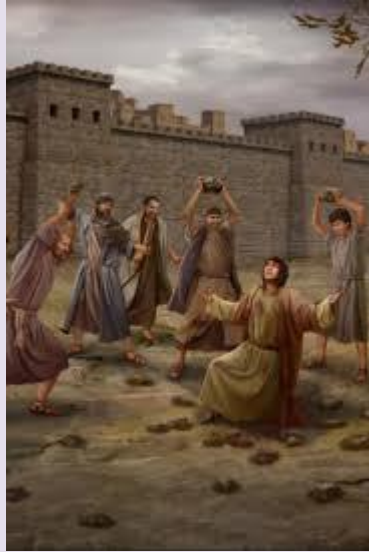
Stoning of Stephen