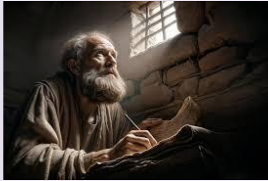
Paul: Apostle to Gentiles