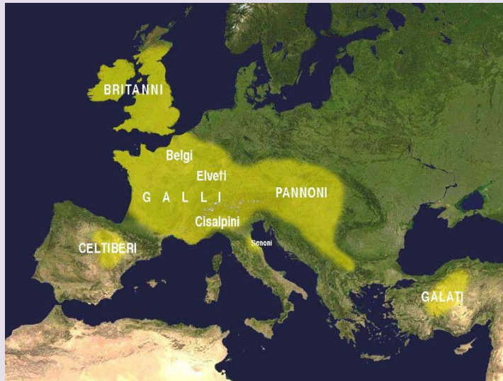
Celts 3 rd Century BC