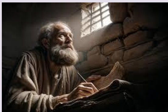
Paul: Apostle to Gentiles