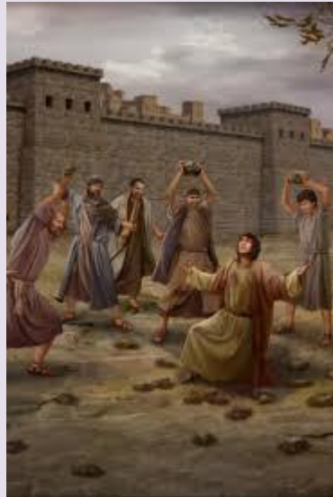
Stoning of Stephen