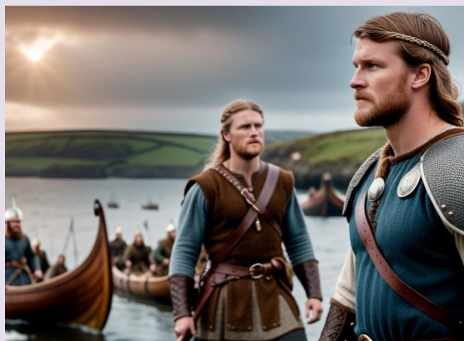
Hair like women; Faces like men

The Norse settled in Scandinavia and Denmark. They had laws, art, architecture, and a pagan religion distinct from their European neighbors: the Celts, Balts, and Slavs. The Norse were hardy frontiersmen, expert sailors and shipwrights; in the West they were famous as warriors, in the East they were famous as traders.