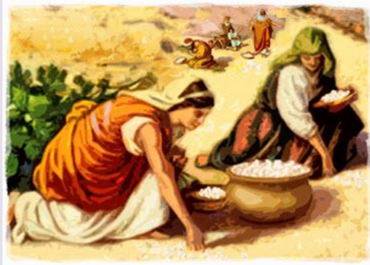
Exo. 16 v 29

And it shall come to pass, that on the sixth day they shall prepare that which they bring in; and it shall be twice as much as they gather daily. And Moses and Aaron said to all the children of Israel: 'At even, then ye shall know that the LORD hath brought you out from the land of Egypt'.