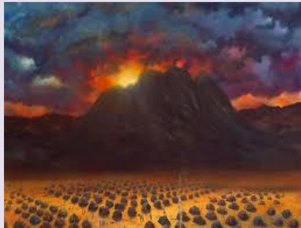
Heb. 12 v 25-29

See that ye refuse not Him that speaks. For if they escaped not who refused Him that spoke on earth, MUCH MORE SHALL WE NOT ESCAPE, IF WE TURN AWAY FROM HIM THAT SPEAKS FROM HEAVEN: Whose voice then shook the earth: but now He hath promised, saying, ‘YET ONCE MORE I WILL SHAKE NOT THE EARTH ONLY BUT HEAVEN’. And this word, ‘Yet once more’, signifies the removing of those things that are shaken, as of things that are made, that those things which cannot be shaken may remain. Since we are receiving a kingdom which cannot be moved, let us have grace, THAT WE MAY SERVE GOD ACCEPTABLY WITH REVERENCE AND GODLY FEAR: FOR OUR GOD IS A CONSUMING FIRE.