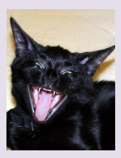
'that serpent of old called... Satan, who deceives the whole world.' (Rev. 12 v 9)

Satan's plan to deceive believers was successful: God's Plan was off track. (But not irreversibly.)