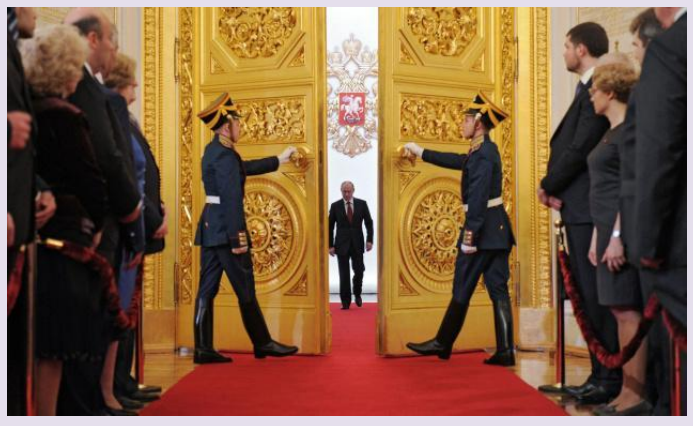
Great Palace of Kremlin 2012

Chapter 1 pin-points Vladimir Putin, Commander in Chief of Russia, as the main focus of the prophecy.