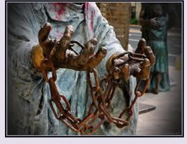
Blinded King Zedekiah in chains