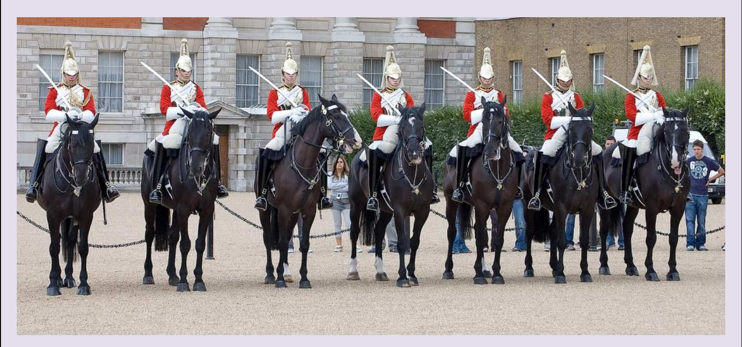
There are 7 horses – just as there are 7 daughters of Zelophehad – both are symbols of the Colonies of the UK