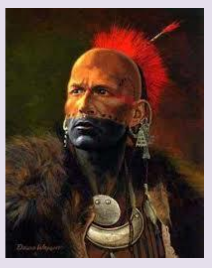
Amorite Warrior (Iroquois Nation)

The Amorites occupied the East bank of the Jordan from Mount Hermon to the border with Gad plus the wilderness of Judah. The Amorites were tall, swift, skilled and brave warriors. The Amorites are prophetic of all the animistic warlike tribes who were the original occupants of the British Isles, Americas, and Africa when explorers first reached them.