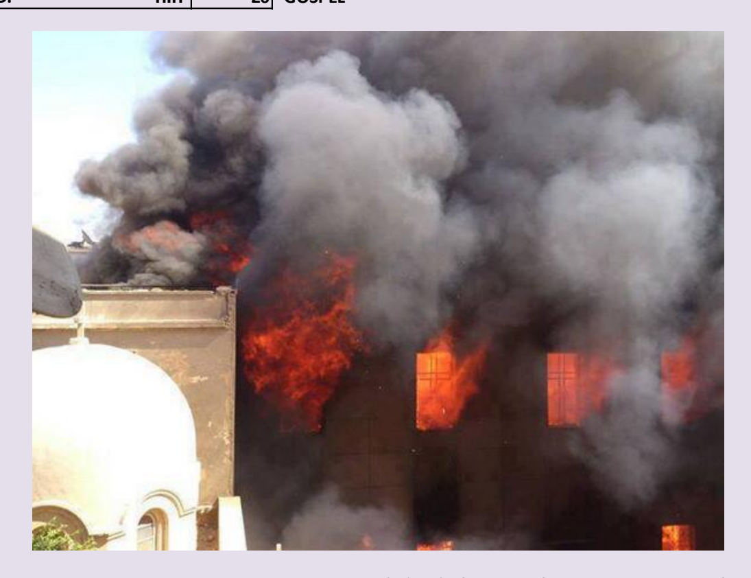
23 Sept 2014 - ISIS burns Armenian church (a 'city' of another feudal religion – sect, faction)