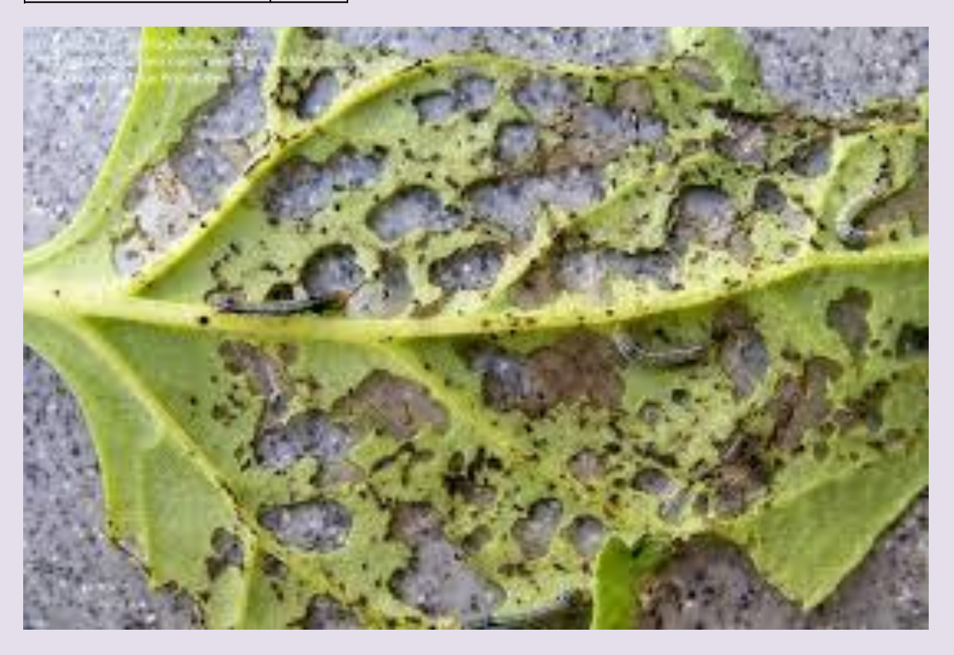
Worms devour the garden of Great Britain 's soul