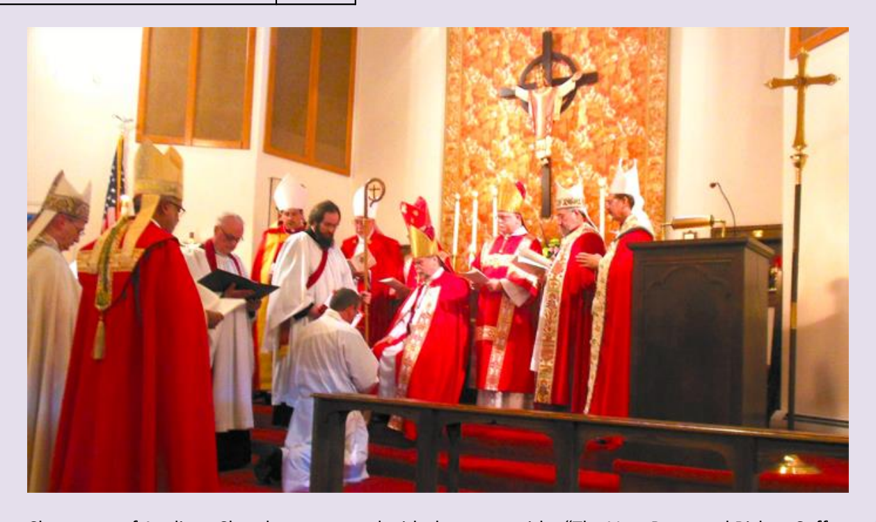
Clergyman of Anglican Church consecrated with the august title: "The Very Reverend Bishop Suffragan"