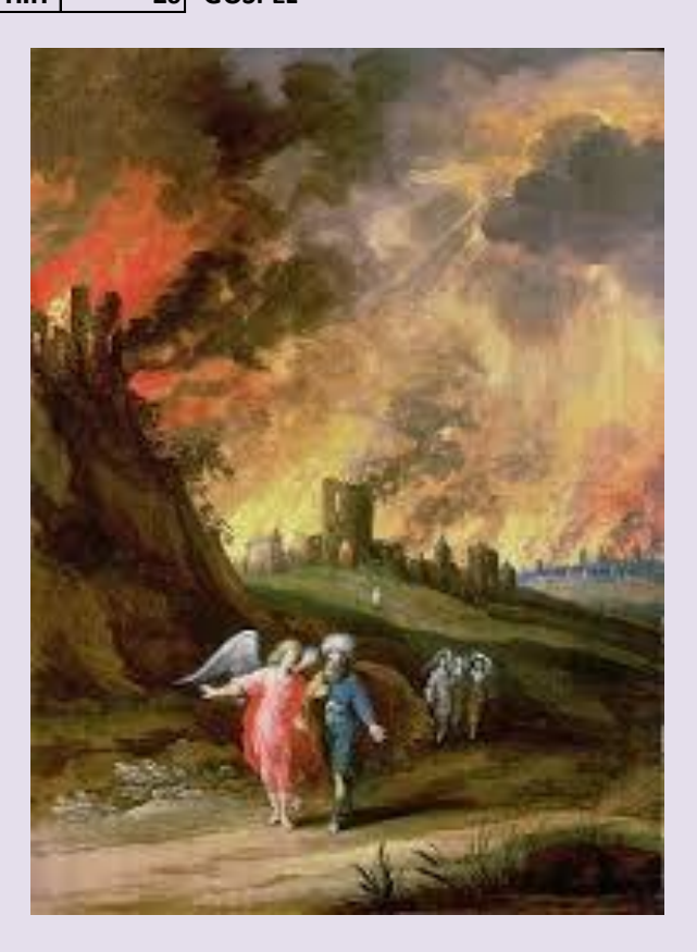
Believers warned of destruction flee Sodom and Gomorrah (Depart the Faith!)