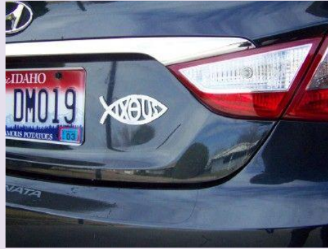
‘I am Rich!’

The third sign: The Seventh Ewe Lamb , the seventh church of Revelations, forsakes her duty to follow Jesus and in His place embraces worldliness: