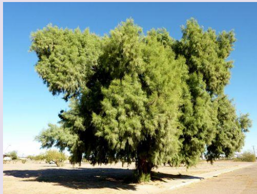
Tamarisk tree (note star of David!)

The first sign: Ishmael [ Islam ] will get a wife [ community of believers ] in Egypt [ America ]. This sign was fulfilled in 1915 when the first mosque was established in America 8 . Today, in 2015 , a hundred years later there are an estimated 2 million Muslims in the United States . New York City has the largest number of Muslims with 70,000. Dearborn, Michigan ranks second with 30,000, and Los Angeles ranks third with 26,000. Paterson, New Jersey, in the New York City Metropolitan Area, is estimated to be home for 25,000 to 30,000 Muslims. Philadelphia, Pennsylvania is estimated to have 30,000 to 50,000 Muslims.