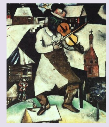
Image: Chagall "The Fiddler" – A Jew fiddles on the roof – he has no home

<u>Does this not describe the misery of the wandering Jews of Europe for nineteen hundred years after Christ?</u> Cain was the first born of Adam – destined to be a patriarch of dignity, honor, and the father's blessing. But he would know none of that. Likewise, the itinerant Jews felt the shame that they were God's chosen people entrusted with God's words - but forced to tiptoe in the midst of the boisterous and boorish Gentiles – people who to a Jewish sensibility were unclean in behavior and who in the Jewish understanding worshiped a different God (or gods).